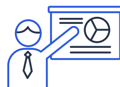
Research Institutions 研究機構

Judge list will be announced on website. 評判團名單將於網頁公佈。